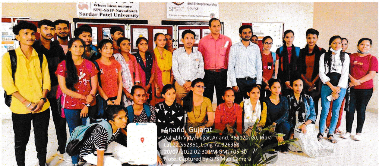
Anand, Gujarat Vallabh Vidyanagar, Anand, 388120, GJ, India Lat 22.552361, Long 72.926358 20/07/2022 02:30 PM GMT+05:30 Note: Captured by GPS Map Camera