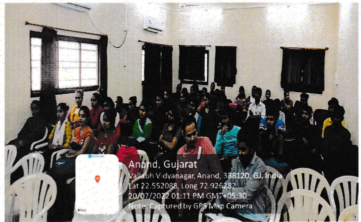
Anand, Gujarat Vallabh Vidyanagar, Anand, 388120, GJ, India Lat 22.552088, Long 72.926282 20/07/2022 01:11 PM GMT+05:30 Note: Captured by GPS Map Camera